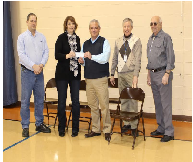
In February, The Gnat Boxers donated funds to Ida Sue School for the purchase of 25 new chairs.